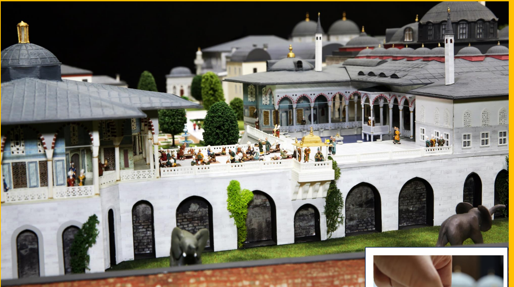
Topkapi Palace III. Court 17 th Century