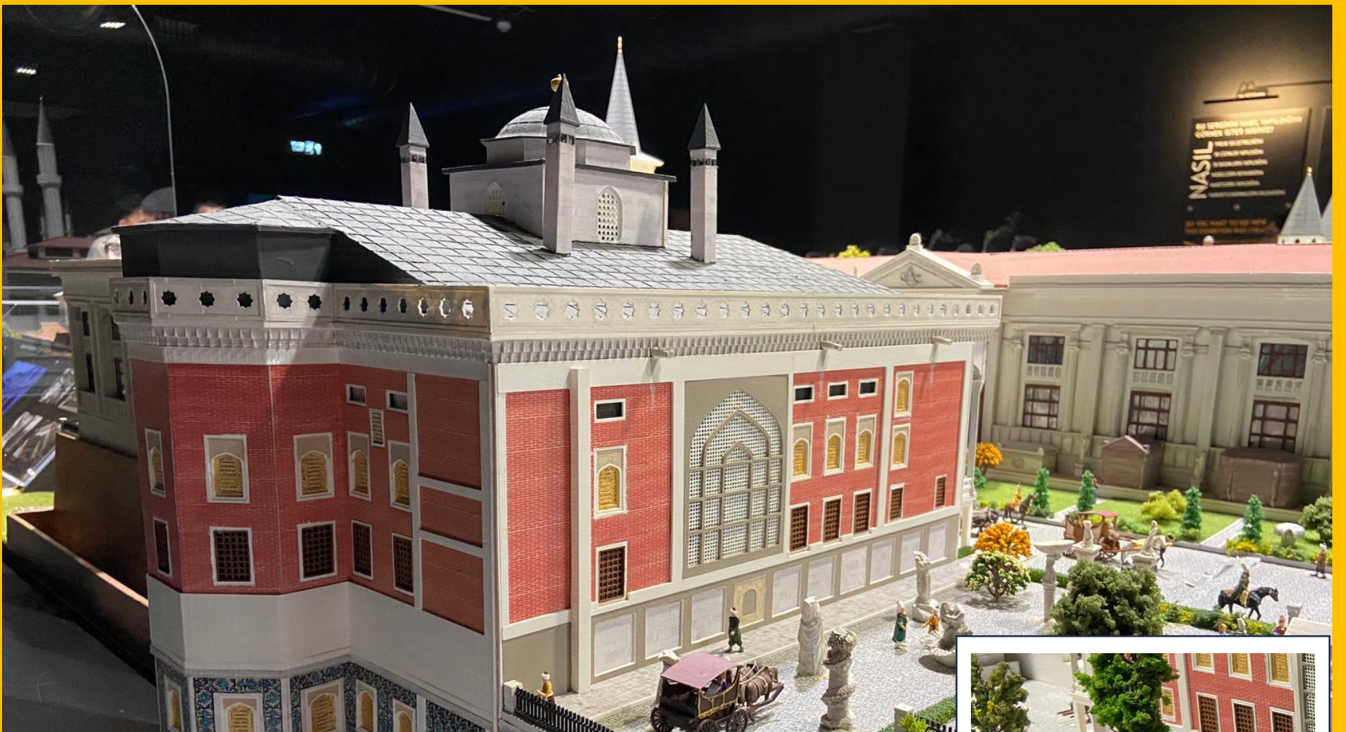
Tiled Pavilion Kiosk